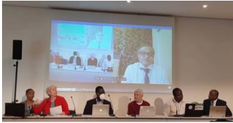
INFORSE SB56 side event in Bonn on June 11 2022

The International Network for Sustainable Energy (INFORSE) sees the Global Stocktake (GST) under the UN Framework Convention on Climate Change (UNFCCC), as an important process to identify and close the gaps in national climate plans to meet the goals of the Paris Agreement, including pursuing efforts to limit global warming to 1.5 °C. This is because all the current Nationally Determined Contributions (NDCs) to the Paris Agreement combined, fall short of meeting its intended goals, the temperature goal as well as the finance goal.