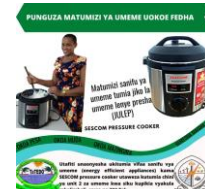
Left to right: Participants at the 18-19/8 Consultative meeting in Dar; Catalogue of Local Solutions (online and print); SESCOM pressure cooker - Jiko la UMEME lenye presha (JULEP) promoted by TaTEDO

On 18 to 19 August 2022, thirty CSOs from different regions of Tanzania led by the Sustainable Energy Forum Tanzania (SEF) coordinated by TaTEDO, WWF Tanzania & Climate Action Network Tanzania held a consultative meeting in Dar es Salaam. The meeting provided input into the development of National Renewable Energy Strategy and Action Plan. According to TaTEDO, the current Tanzania National Energy Policy 2015 is due for update to take on board new challenges including renewable energy issues